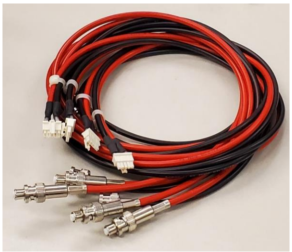
Terminated BNC-to-Samtec SHV cables